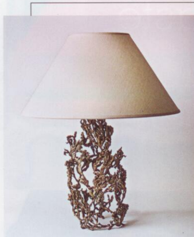
TOP RIGHT Casamidy Hiver chair, $1,550. ABOVE Tuell + Reynolds Gualala lamp, $1,400.

Instead of tacking your child's (or your own) art to the refrigerator, send it to Carpetzz . The company will turn it into a one-of-a-kind, hand-tufted New Zealand wool rug. carpetzz.com .